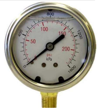
Dimensions in mm